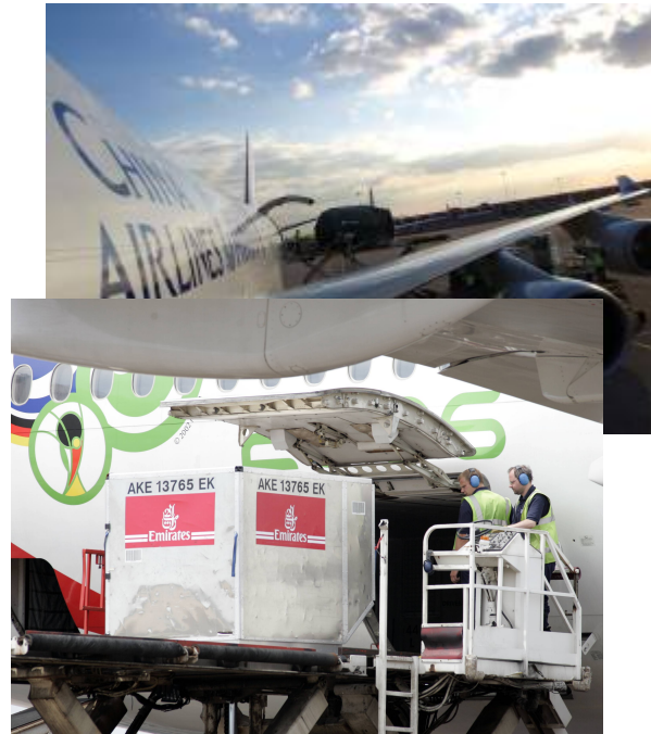
Pure Freight and Bellyhold